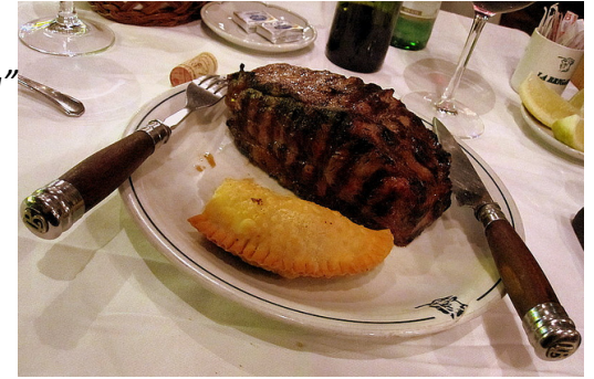
Empanada and Bife de Chorizo at "La Brigada"