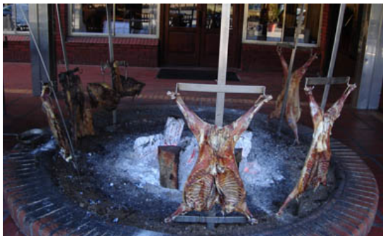
Vaca, Cordero y Chivito "al Asador" (beef, lamb and goat on the pit) at La Tranquera