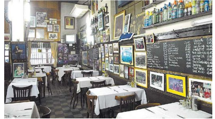
Bodegon Obrero, in La Boca